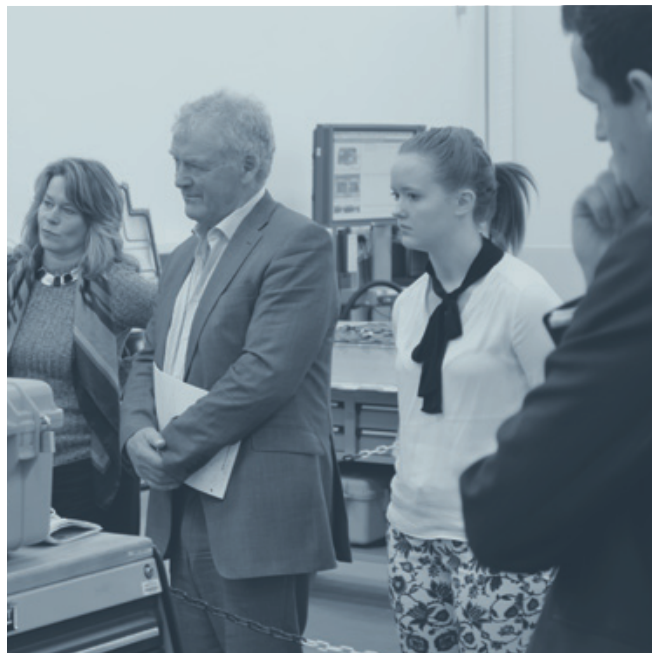
A cross-party group of MP's visit BMW Training Academy (March 2016)